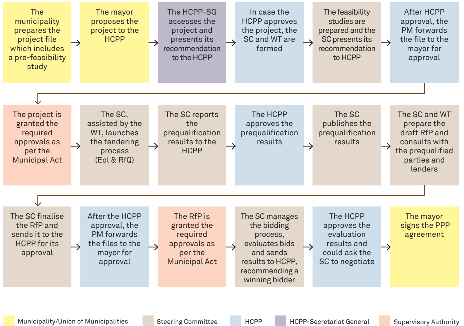
Figure 3. The complexity of the municipal PPP tendering process under PPP Law No. 48.